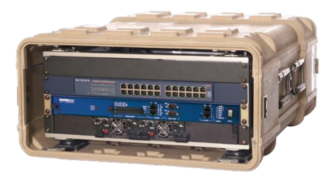
Custom-configured SLICE IP Tactical Communications Package

The REDCOM Tactical Communications Package (TCP) is built to withstand the harsh conditions of airlift, seaborne transport, and off-road transportation. The transit cases meet stringent government and defense specifications for impact and vibration. REDCOM's TCPs are installed in ships, trucks and Humvees, as well as communications shelters and remote encampments or tent cities. No matter how you deploy, REDCOM's TCP is designed to go with you. Interoperable, battle-tested, and man-portable, the custom-configured SLICE IP TCP package delivers maximum communications flexibility.